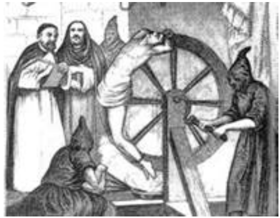
The frightening thing with this device is the rising adjustable bed of spikes. This was replaced with a pan of fire depending on the executioner's choice.