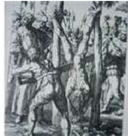
Christians were sawed in half.

(See, www.Bibleversiontruth.com for more information.)