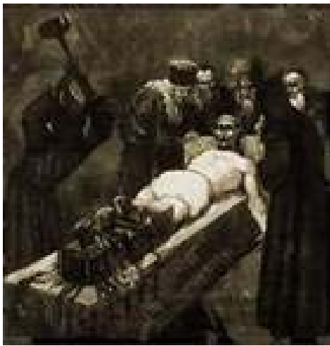
Christians were crushed with a sledgehammer starting with the feet and moving inch by inch towards the stomach area.