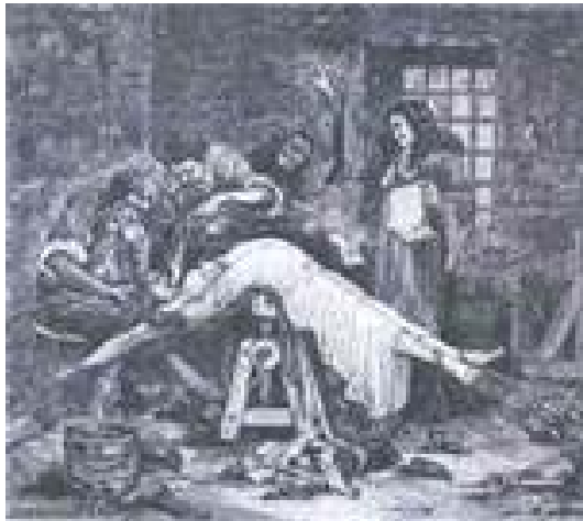
A woman is having her back broken