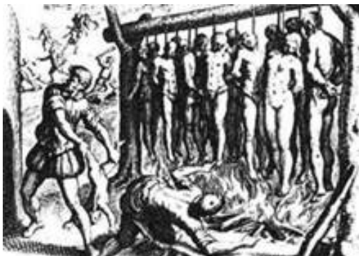
Christians were strip naked, hung by their necks and burn with fire; their little ones repeatedly slam to hard surfaces until they die.